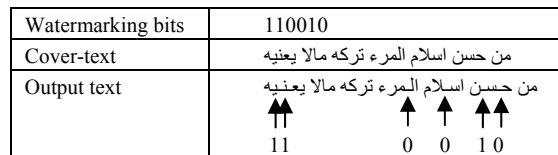
Figure 4: Watermarking by adding Kashida before letters

To add more security and misleading to trespassers, both options of adding extensions before and after the letters can be used within the same document but in different paragraphs or lines. For example, the even lines or paragraphs use watermarking of extensions after the letters and the odd use extensions before or visa versa.